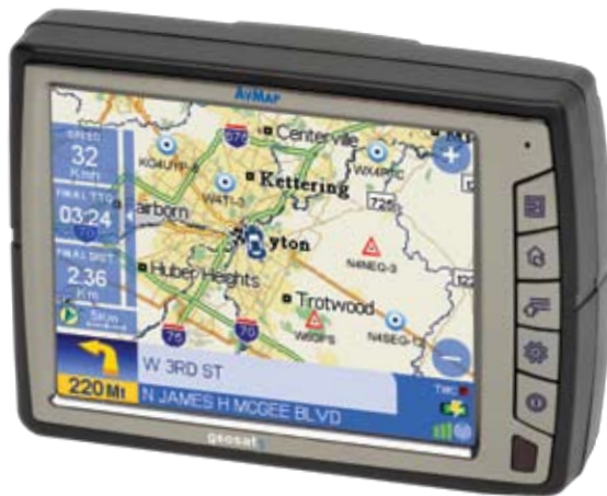
AvMap Geosat 5

Receive a $50 USD check back via the USPS mail. Please allow 6-8 weeks for processing